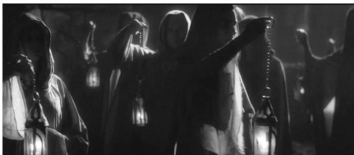
Figure 2. Exodus from Rivendel (movie's snapshot); The Two Towers (Special Extended DVD Edition), Chapter 38.

The 'duration' of the music, which is the fundamental gesture of this musical world, symbolizes the Elves' lengthy history, their eternal memory and immortal life. Time is an unimportant category to the Elves; so, in this music, time and meter are also unimportant. The vocal/choral music, with a strong echo effect, creates an acoustic situation typical of a Gothic cathedral – not a forest, as the scene would suggest 11 . With the inconsistency between what we see and what we hear, an entirely unreal situation is created, but for listeners, it evokes an impression like that of being situated in the middle of a beloved shrine. In this way, the Elves' virtual world, as constructed in the film, is juxtaposed with the subconscious musical vision of an eternal mystical world. The prevalence of minor mode, a complicated, chromatic melodic shape (see Figure 3 below), lack of instruments and absence of dancing elements – this is the musical vocabulary that makes up the peculiar 'Eastern' atmosphere of the Lothlórien scenes.