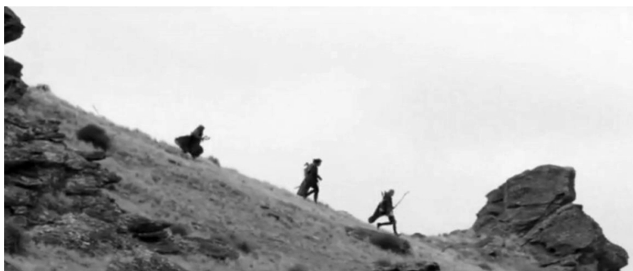
Figure 7. Uruk-hai versus Aragorn – ‘long march’ (movie’s snapshot), Chapter 9.

The opposing themes of Uruk-hai vs. Aragorn are a perfect example of transference of the action from dialogue or gesture to musical scenery. The audience can see only two groups of moving persons on the screen. The viewers do not know anything about their relationship. It is only the music which explains that the Uruk-hai motif of brutal force is being conquered by Aragorn’s virtuous and glorious motif. The triumphal fanfare for the Returning King foretells the final victory of Good over Evil. Such a prophetic role of music is particularly important at this moment of tale, when the situation of the protagonists becomes dramatic and one can expect that there is no hope anymore .