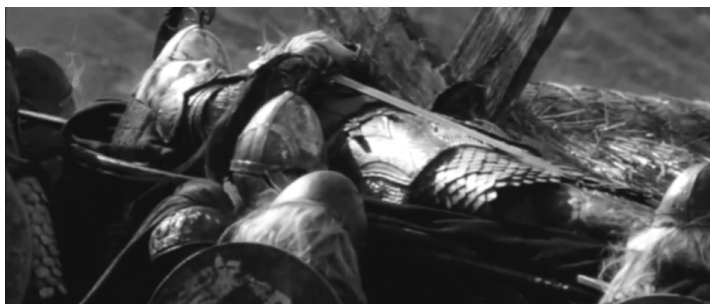
Figure 6. Funeral of Théodred (movie's snapshot), Chapter 21.