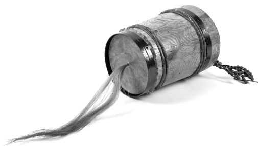
Figure 1. Gutbucket (Polish burczybas) at the Museum of Folk Music Instruments in Szydłowiec.

The principal keeper of the rhythm is the gutbucket, a typical folk-style instrument popular in many European countries (including Poland). The main melodic instrument is, again, the fiddle – accompanied by a bourdon instrument performing a characteristic standing bass note, along with a dulcimer and a whistle in the refrain – quite a large ensemble for a folk party. Such an instrumentation is generally based on the Welsh musical tradition – which confirms Tolkien’s admiration for Wales. The same applies to the duple meter, representative of old Celtic music and used throughout the party. The above-mentioned scene at the Green Dragon refers to the tradition of drunken chants – so popular at pubs to this day. Once again, one must admit – the music here does not only illustrate the action; it creates the mood of the entire sequence of scenes, recreates the world and modifies spectators’ understanding of Hobbiton.