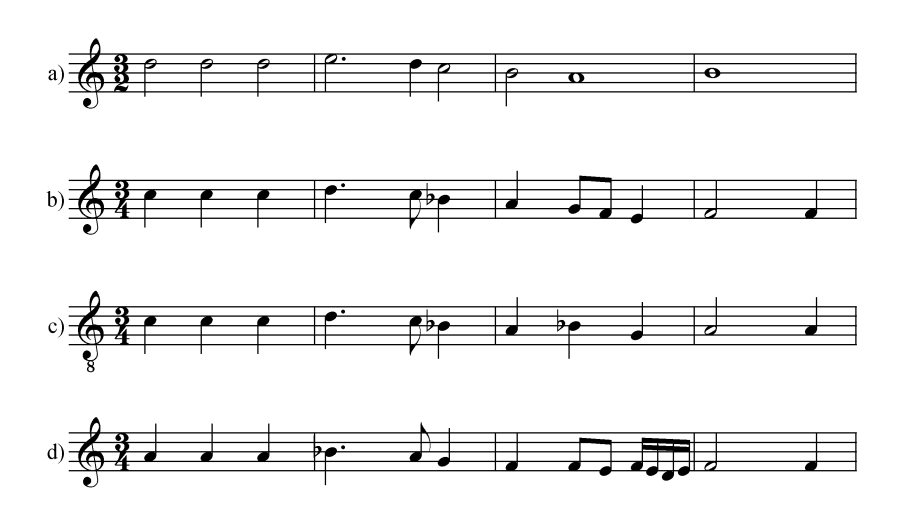
Example 2. Dance phrases: a) Rappresentazione No 15, ritornel; b) The Tablature of Jan of Lublin , fol. 111v, bars 9–12 and fol. 213v, bars 17–20; c) as above, fol. 132r Rex bars 29–32; d) as above, bars 33–36 and fol. 221v Italica bars 31–34.