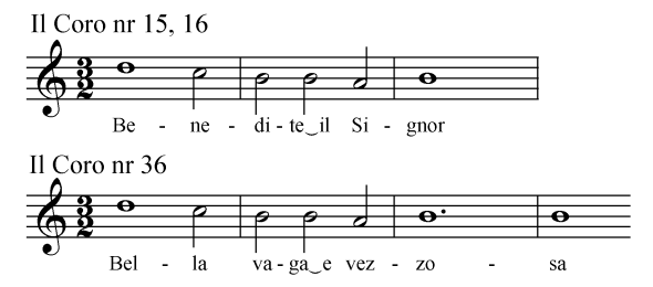
Example 1. Emilio De' Cavalieri Rappresentazione di Anima e di Corpo . Excerpt from Nos. 15 and 16: [Bless the Lord] and from No 36: [Beautiful, graceful and charming].

and 87. Variant of the first schema is met with in passages Nos. 15 and 84 and in the sinfonia after Act II, whereas the characteristic rhythmic phrase \int \int \int | \cdot | \cdot | appears in passages Nos. 15, 18, 24, 51, 54, 72 and 77, among others. All these solutions are at variance with the accepted principle of varietas . However, both the introduction of triple meters and the repetition of the same rhythms are carried out by Cavalieri with an intrinsic justification. Triple meters occur usually with texts of a joyful character, irrespective of the value attributed to this joy. This may be best illustrated by the use of a similar melorhythmic phrase in the part of the Chorus to the words "Benedite il Signor" [Bless the Lord] and in the alluring part of Earthly Life, when she says "Io son [...] bella vaga e vezzosa" [I'm beautiful, graceful and charming]: