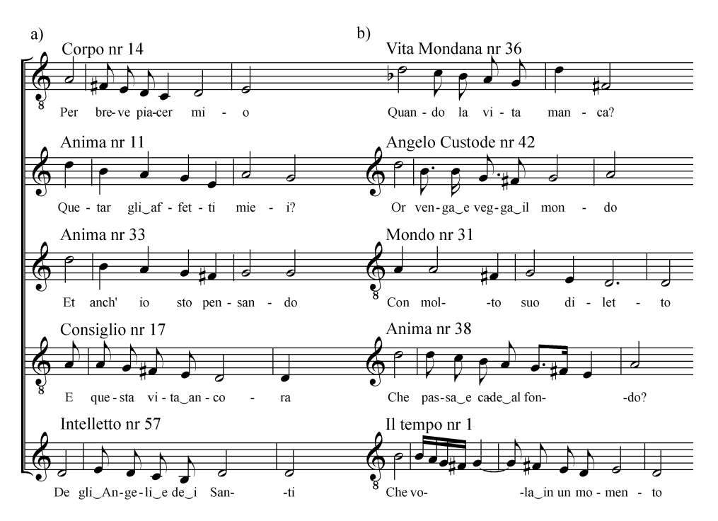
Example 12. a) excerpts from No 14 [For my short delight...], from No 11 [To satisfy my feelings...], from No 33 [I am also reflecting...], from No 17 [Whereas this life...], from No 57 [The Angels and Saints...]; b) excerpts from No 36 [When life is ebbing...], from No 42 [Let him come now and see the world...], from No 31 [With his great pleasure...], from No 38 [What passes by and goes to the bottom...], from No 1 [What flies away in a while...].