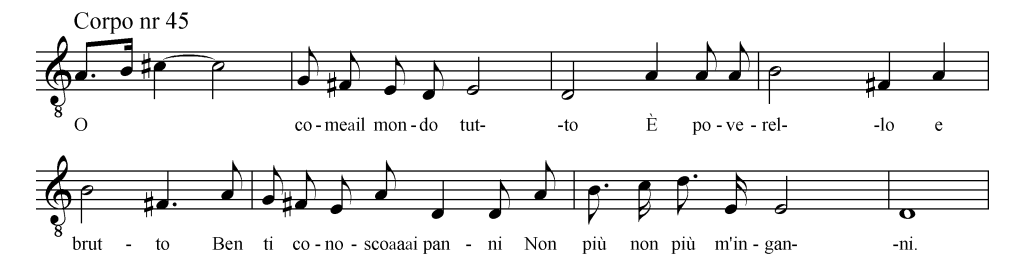
Example 15. As above, excerpt from No 45 [Oh, how poor and ugly / the whole world is, / I recognise you well by your clothes, / you will never deceive me again.].

The appropriate sphere of action for feelings are the parts of Soul and Body; they are also characterized by the greatest differentiation of phrases: from those expressing the sublime and therefore formed most objectively to phrases representing the earthly sphere, composed more freely and diversely. All the technical procedures, dictated by the intention to render affections, find expression in these latter phrases. Here is an example showing how unconventional, and how impregnated with emotion, this language can be: