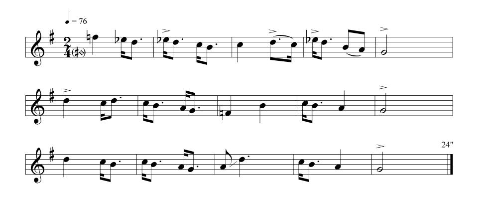
Ej, na "orawskiej pyrci k<br/>"ozicka sie krynci, |\colon "oj, k"ozicka, nie kryńć sa, strzelem ci do sérca<br/> :| .

CUT[Ej, na orawskiej pyrci] SRC[Sadownik 1971: 259 No 1] KEY[exam-1 16 G 2/4] ZZ[3] MEL[7b_6b5_. 6b5_.43_. 4_{5_.4} 6b5_.{3_2} 1___ 5_45_. 43_.21_. -7b_3__ 43_.2__ 1___ 5_43_. 43_.21_. 2_5_.43_.2__ 1___ //]